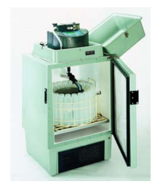
6712 FR refrigerated sampler