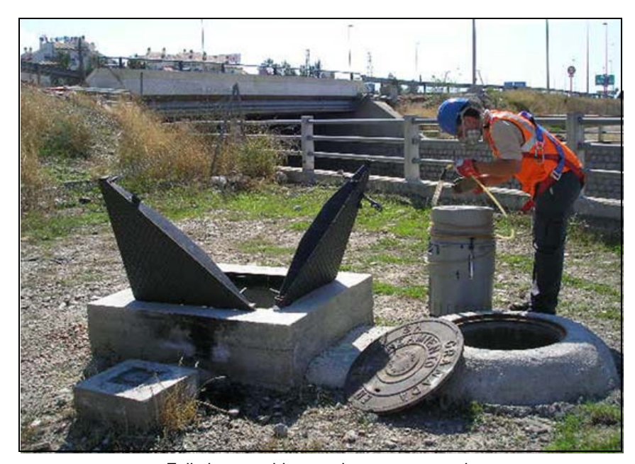
Full-size portable sampler at a remote site

A 6712 full-size automatic sampler from Teledyne Isco, Inc. is at the heart of portable systems that remotely monitor water quality from industrial sites in Granada, Spain.