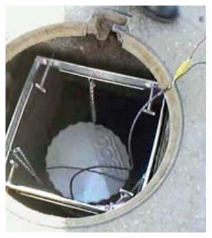
6712 Full-size sampler installation in manhole

A 6712 full-size automatic sampler from Teledyne Isco, Inc. is at the heart of portable systems that remotely monitor water quality from industrial sites in Granada, Spain.